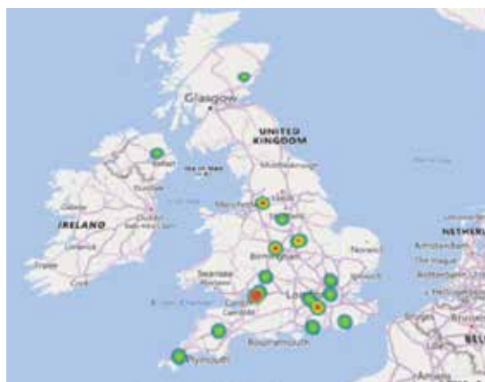
Figure 2: Academic Institutions engaged with through the Train the Trainer programme

Beyond this, however, Figure 1 points to strong emerging clusters of immersive production in places such as the West Midlands, Greater Manchester and Liverpool, Brighton and East Sussex.