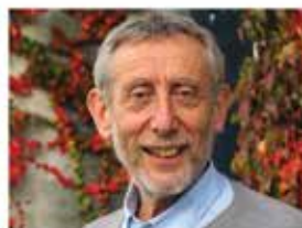
Michael Rosen , Author & TV Presenter