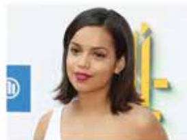
Georgina Campbell , BAFTA Award-winning Actress