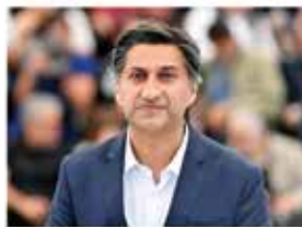
Asif Kapadia , BAFTA Award-winning filmmaker