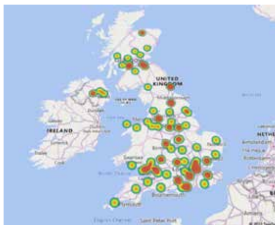
Figure 3: Location of Beneficiaries of Experimental Labs and Writers Rooms

Figure 3 shows the geographic spread of the beneficiaries of our Experimental Labs and Writers Room workstream, illustrating the importance of this format in reaching talent across the UK. Our pivot to a combination of remote and in-person labs, originally necessitated by the Covid pandemic, has greatly improved accessibility of our training and we continue to offer a range of remote and in-person labs and events throughout our programme.