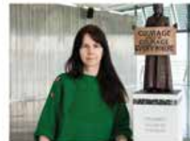
Gillian Wearing CBE , Turner Prize Artist