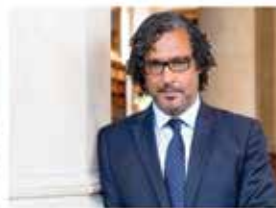
David Olusoga OBE , Historian, Writer, Broadcaster, Filmmaker