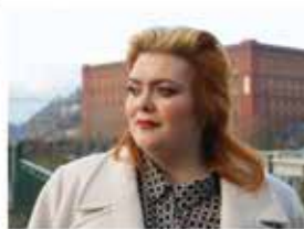
Jayde Adams , Comedian, actress, writer and singer