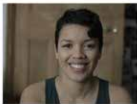
Cecile Emeke , Filmmaker, Writer and Artist