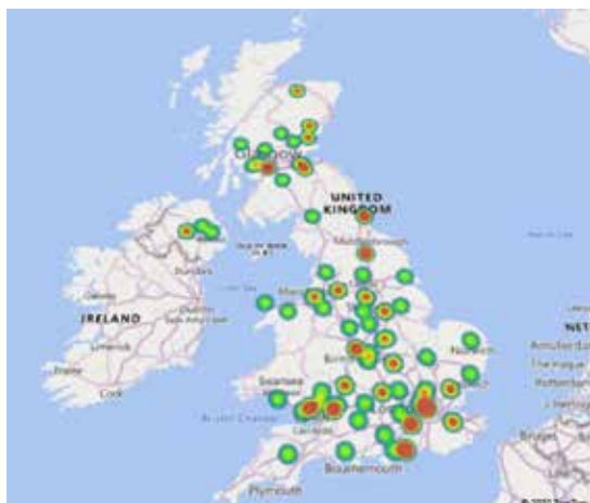
Figure 1: Location of all programme beneficiaries

Figure 1 demonstrates the spread of our work across the nation. Hotspots correspond with our engagement with the Creative Industries Clusters Programme, with strong activity identifiable in areas such as Cardiff, Belfast, Abertay, Bristol, York, Surrey and London serviced by Clwstr, Future Screens NI, InGAME, B+B Cluster, XR Stories and StoryFutures respectively.