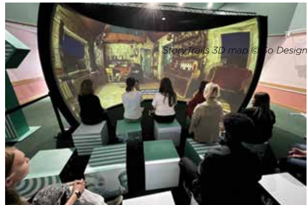
StoryTrails Cyclorama cinema Omagh 1996